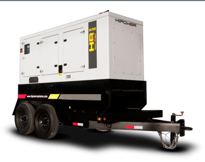
Photo depicts a typical model but may not include options such as trailer.