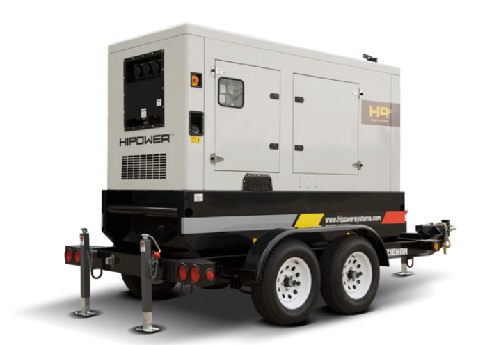
Photo depicts a typical model but may not include options such as trailer.