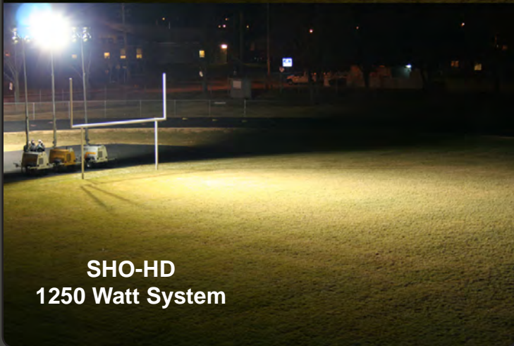
SHO-HD 1250 Watt System