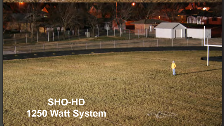
SHO-HD 1250 Watt System