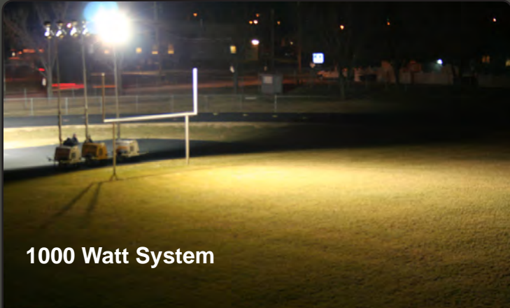
1000 Watt System